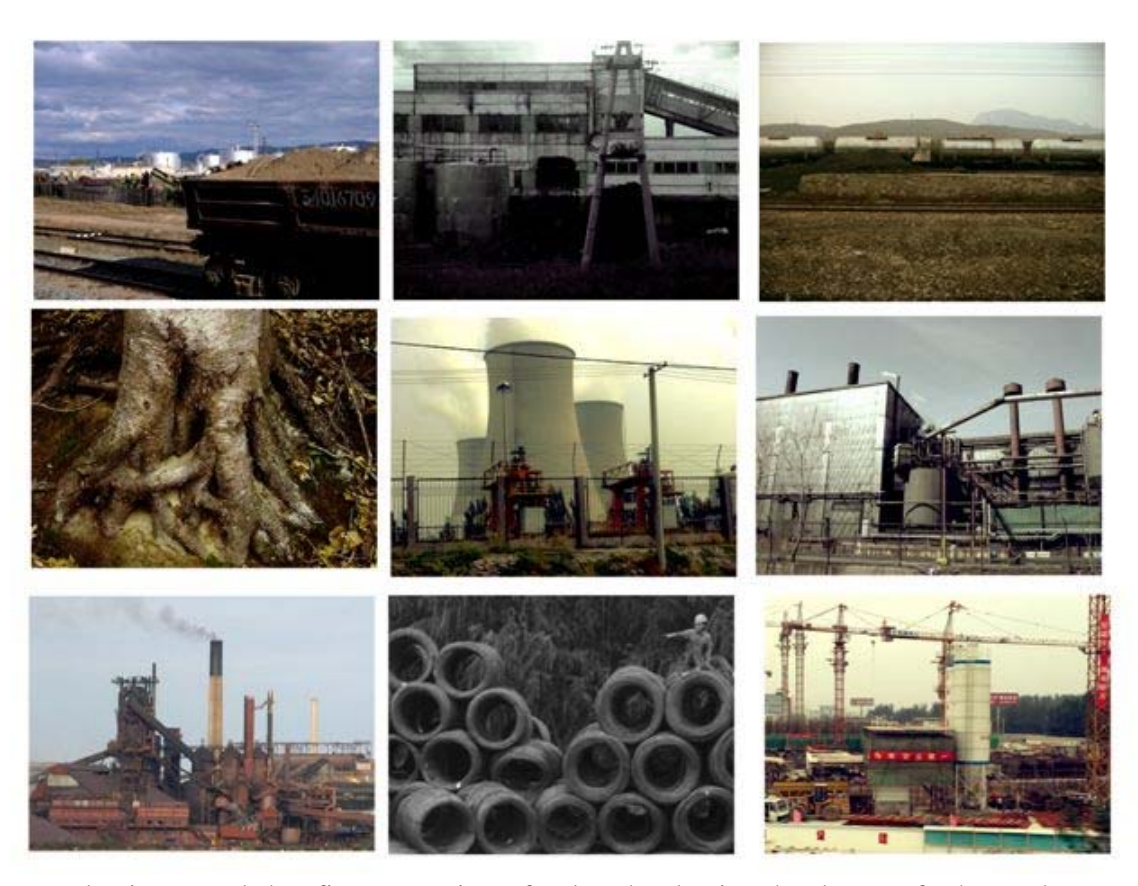
production – and that first extraction of value that begins the drama of what Deleuze and Guattari describe as the nightmare of every social formation: capital.

The German architect, Karl Friedrich Schinkel, visiting Manchester in 1825, wrote: "Here are buildings seven to eight storeys, as high and as big as the Royal Palace in Berlin." The moment when factories grow taller than palaces is for Schinkel a melancholy one: the passing of history from the era of ornamentation and aesthetics into the plainer, more utilitarian world that would follow. But this moment marks another passage, too. When the factory exceeds the palace, we enter a space of social contestation: politics emerges from the world of powdered wigs and enters the streets. It is hardly surprisingly that the mirror-shade aesthetic of globalization seeks to banish smokestacks and factories to the hinterland, in the process trying vainly to drag politics back out of the streets to sequester it in the lifeless hermeticism of the glass-and-steel boardroom. Luckily as fate would have it, the politics of the street are as irreversible as the still glowing embers of the industrial age.