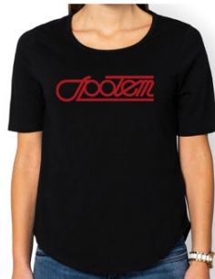
Figure 1: T-shirt with logo of co-operative founded in the era of People’s Poland – image produced using creator on megakoszulki.pl website.

Over the last few years I experimented with three different forms of expression, which, I hoped, would allow me to express my sentiments in a more direct manner, by intervening directly in the public space. The first one was t-shirts. As ‘patriotic clothing’ was becoming a trend in Poland (including brands such as ‘Red is Bad’ opening shops on main shopping streets in Krakow and Warsaw), I decided to experiment with the idea of reclaiming symbols of People’s Poland. I chose not the overtly ideological ones which are not only extremely loaded symbolically, but also explicitly banned by the Polish law – but symbols of institutions which in today’s capitalistic regime could be looked upon with nostalgia, such as beautifully-designed logos of various co-operative initiatives. While my ‘Społem’ (co-operative grocery store) t-shirt was commented on favorably by friends, and a bit ironically by family-members belonging to the older generations, it failed to realize its goal, as it was not perceived as a political or ideological intervention, but rather as a playful borrowing of vintage logotypes in the vein of hipster aesthetics.