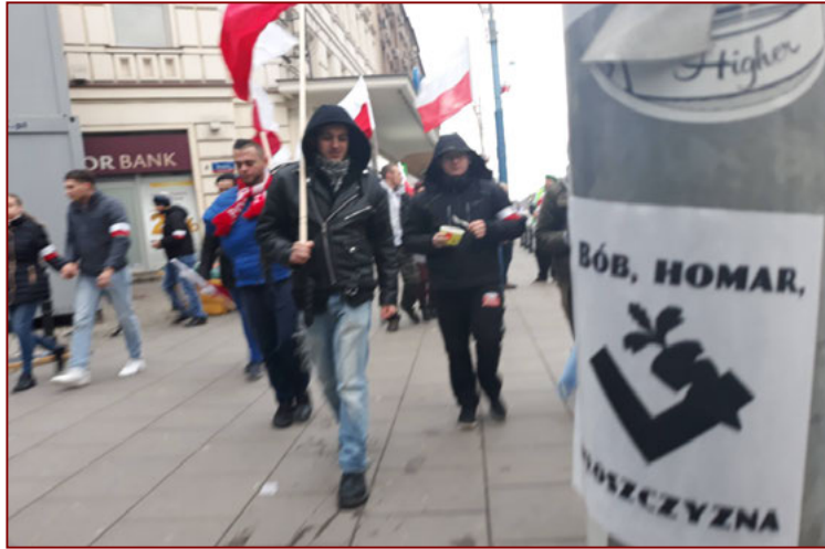
Figure 3: Picture of the sticker art subverting the ‘God, honor, homeland’ slogan. The sword in the nationalist Falanga symbol was replaced with a carrot. In the background: participants of the Polish Independence Day celebrations 6

In the context of these varied experiences in engaging with the feminist agenda and combating the anti-feminist (anti-progressive) movement in Poland, I would be tempted to say that the less academic my intervention was, the more powerful. The less wordy, the more it was read. At the same time, however, I realize that while this bottom-up urban activism was not academic in its character, it would have never taken place had it not been for my academic background and inspirations. Without the ‘academic moments’ the ‘activist moments’ would not have been possible. Taking up, once again, Gramsci’s concept of historic bloc, I would see my academic writing and my every-day, pop-culture or urban-culture gestures as attempts to intervene on different levels in a social movement which is complex, multi-dimensional and multi-faceted, as attempts to disrupt the existing historic bloc.