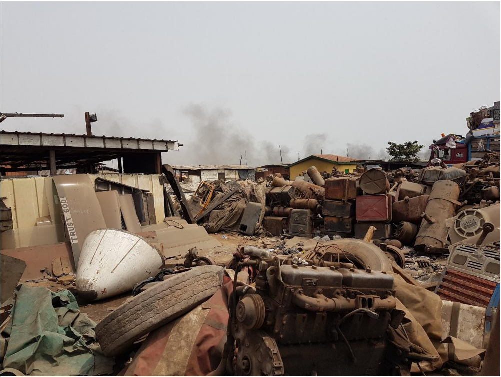
Figure 4: Complex scrap yard order at an informal site.

Both images, our research emphasizes, are not doing justice to the complex recycling realities and their limits (see also Fernandez-Font Perez, 2013; Lepawsky, 2018; Schulz, 2015). In the pictures shown below (figure 4 and 5) we have confronted the two worlds with a rather different set of pictures. The informal sector (figure 4) is not as unorganized as it seems. One needs to appreciate the complex ordering of the scrap yard not always visible at first glance; it is indeed similar to the formal operations, which simply use more and (crucially) more expensive tools to do the job of sorting (figure 5). Most importantly, only a small fraction of informal labour surrounding e-waste is dangerous. Daisy tries to enforce Rujanavech et al.'s (2016) 'safe' and 'clean' practices that culminate in making the e-waste sector invisible from the landscape (Apple, 2019a).