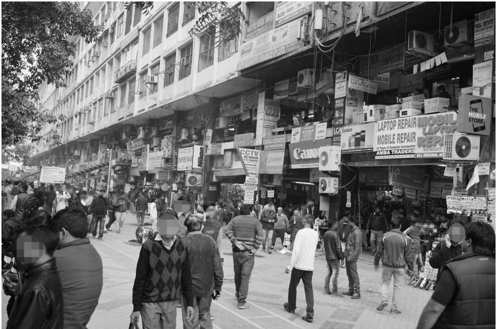
Figure 2: Nehru Place, Delhi.

A third way (c) is known to be, as introduced above, the recycling of the materials included in a device. Waste plays an integral role in the global economy and is a permanent feature as demand for critical raw materials grows and concerns are raised regarding finite resources (European Commission, 2015). Engineers have trained themselves to know which materials they are confronted with and which ones may be captured in a safe manner (Minter, 2013). During the visit to the German recycling and smelting facilities Stefan, for example, learned about the complex arrangements that make a sound assessment of materials delivered possible in the first place. Imagine a seller were to drop 40 tonnes of e-waste materials at your premises – a truck loaded with a complicated selection of printers, toasters, personal computers, servers, etc. And you have to pay this seller the appropriate amount of money, manoeuvring the slippery slope of gains and losses. Workers at the recycling site need to react to the changing material compositions of the deliveries, adjusting machines, looking for crucial objects, and sensing changes. Not every delivery can be checked separately, because different contracts emphasize different assessments, which makes this endeavour so interesting and in need of trained personnel.