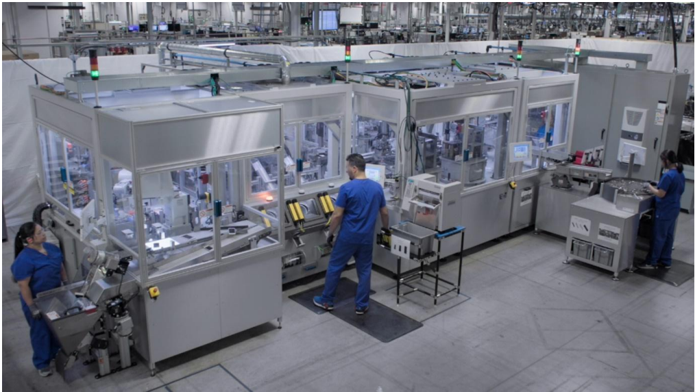
Figure 3: 'Apple introduces Daisy, a new robot that disassembles iPhone to recover valuable materials'.

Protected by glass, she operates alongside her co-workers (humans among them indeed!) engaged with the dismantling and the 'GiveBack' process. In contrast to Liam's presentation there is no narration; the music is softer, and subtitles inform how she enables