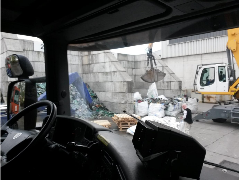
Figure 5: Ordering practices and tools at a formal recycler's site.