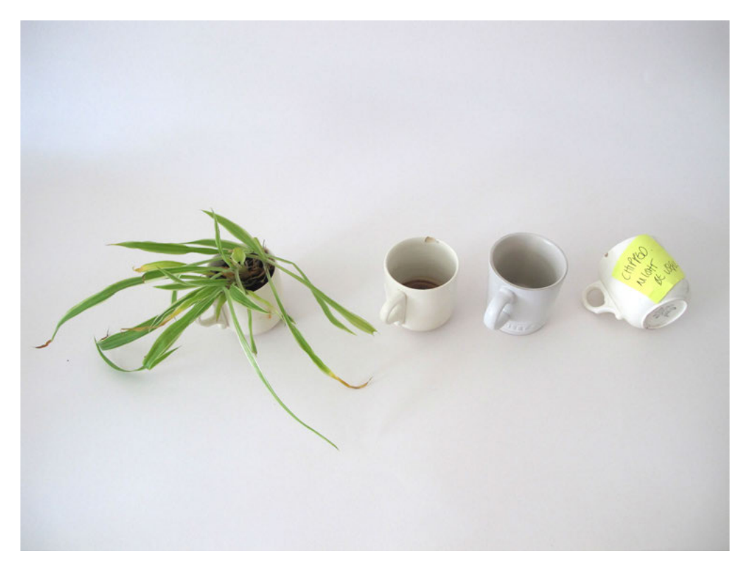
Image 1: Spelman Cups (2016) ceramic, mixed media.