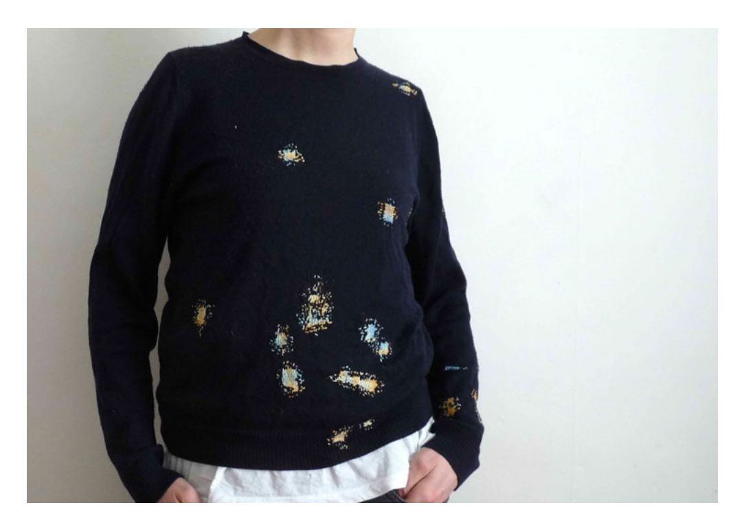
Image 4: Blue Jumper (2012 onwards) showing visible darning by Bridget Harvey.

There are tensions inherent in anti/consumption practices and the politics of repair work for Repair-Makers. Repairing initiates a different route to consuming new items, but does not encourage manufacture of repairable goods or goods for repair, yet by engaging with manufacturers who embrace reparability, the act of anti-consumption becomes redundant. Wearing a visibly repaired garment is potentially a privileged choice unavailable to those who, for example, must wear a company uniform (or those whose items are not well-made enough to warrant repair or to withstand it?). Repairing clothing visibly might mean not purchasing a new garment, but repair-slogan tee-shirts are often new to the owner, printed especially. Visible repair work encourages community and signals ones politics, but in doing so might exclude others - those who don't or can't repair, who feel unable or unwilling to join that movement. A repair practice that maintains an anti-consumption stance, for example, darning a jumper with leftover yarn, might not work for another object, like a smart phone with a dead battery. Consumption, in relation to repair, requires a conscious thought process around purchasing practices, and may result in a swap, a make-do or gifted part. The repair-maker must, along with their 'attitude to the past', pay mind to the future.