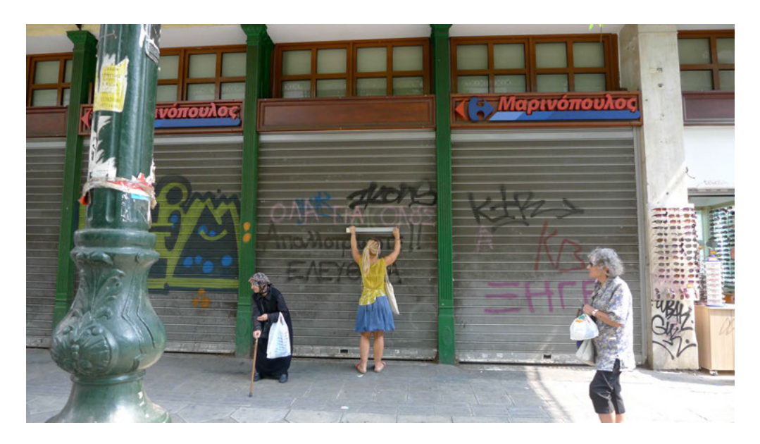
Image 4. Civic Zones: Potentials, 2012.

reminds us that the 'evolution of culture (technology, ideology) feeds back into the regulation of life, influencing – and obfuscating – the means by which power carries out the fundamental task of controlling and managing reproduction' (Preciado, 2018: n.p.).