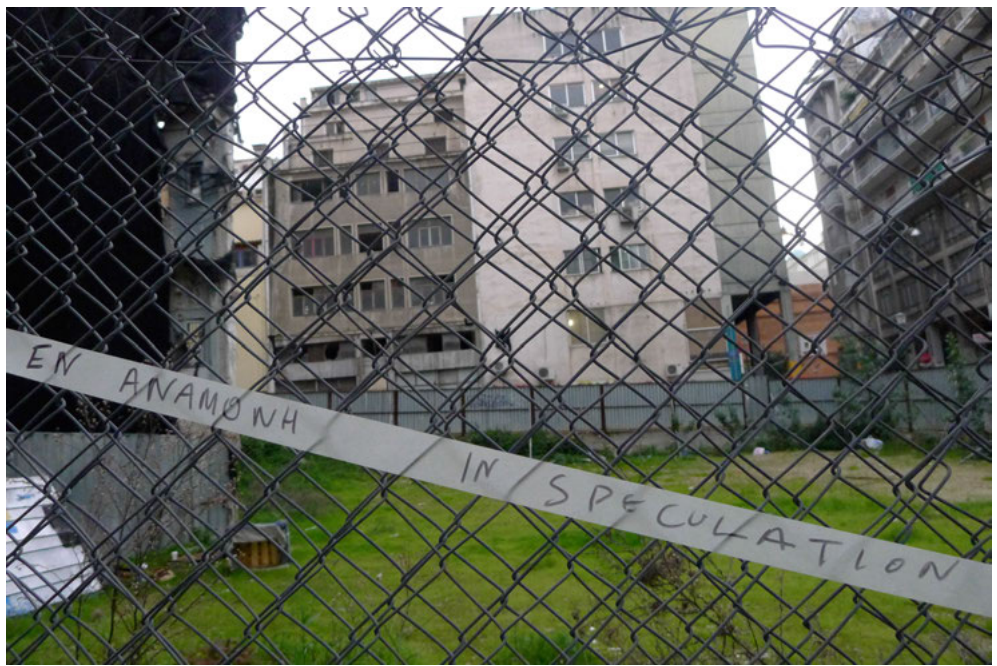
Image 5. Civic Zones: In Speculation, 2015.