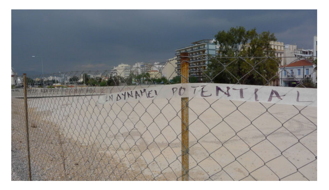
Image 3. Civic Zones: Potentials, 2012. Photo: Gigi Argyropoulou and Hypatia Vourloumis.

itself known' and where 'repression or blockage is not working' (Gordon, 2004). Thus, in mending things that alter those things in unpredictable ways, the aim is not to return them to their original state and function, but to create new forms where making and repairing are one and the same, where fugitive planning is 'the ceaseless experiment with the futurial presence of the forms of life that make such activities possible' (Harney and Moten 2012: 74). To occupy and maintain neglected social and cultural spaces is to live in and repair the very notion and practice of sociality and cultural production through brokenness. Our walk materialised a performative refusal of settling where exiting a broken political and economic system potentially takes place by an illegal breaching of walls: collective attempts to fugitively plan the repair and transformation of haunted abandoned spaces as modes of emergent inquiry and 'aesthetic sociality' (Harris, 2018).