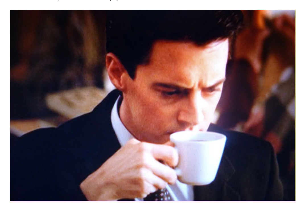
Figure 4: Agent Cooper at the Double R Diner

Heterotopias are informed by the transgressions of their boundaries, by the enunciations they encourage and the contradictions they incite. We can see their effects everywhere we choose to look, but the question is whether we will so choose. (Dumm, 2002: 46)