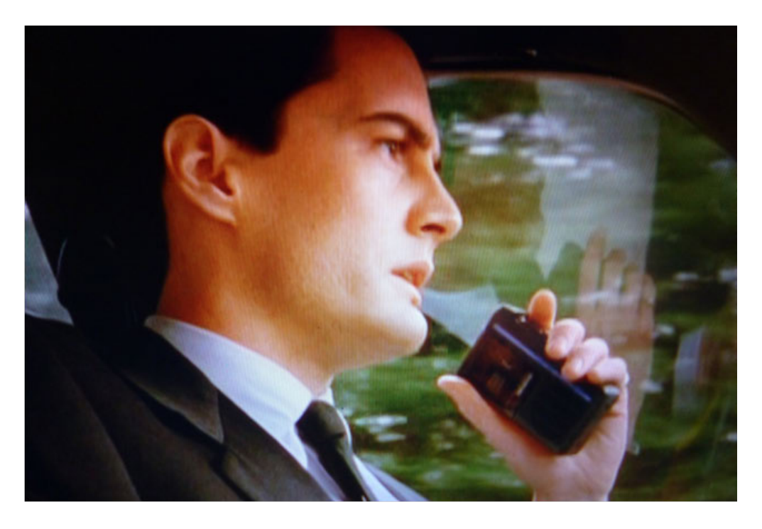
Figure 1: Agent Cooper driving into Twin Peaks<sup>3</sup>

characters and 'supernatural' overtones (Hewitt, 1986/2009).<sup>2</sup> Before we analyze TP's 'city of absurdity' in more detail, we discuss below the Foucauldian concept of heterotopia. It will serve as an analytical lens in our exploration of TP's sites of (other) organizing.